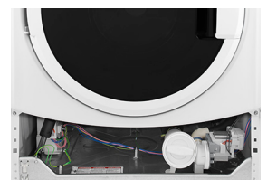
FRONT ACCESS PANEL